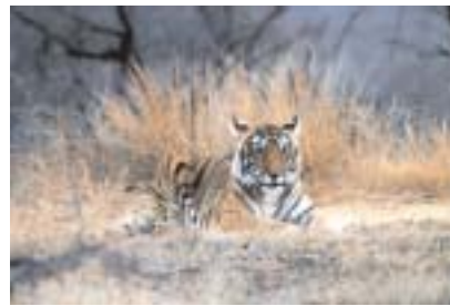
Tiger at Kanha National Park

Thick sal forests, tall bamboos, swaying grasslands and meandering rivers – this is what Kanha is all about. Located in the Mandla district of