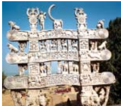
Main Entrance of Stupa

law, is the best preserved of the gateways. Scattered around the site are pillars and their remains. The most important is Pillar 10 , which was erected by Ashoka and stands close to the southern entrance the great stupa.