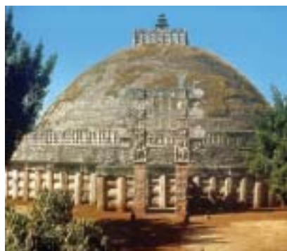
Pillar 10 at Sanchi Stupa

law, is the best preserved of the gateways. Scattered around the site are pillars and their remains. The most important is Pillar 10 , which was erected by Ashoka and stands close to the southern entrance the great stupa.