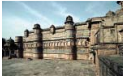
Man Singh Palace (Man Mandir)

Tantiya Tope and Rani of Jhansi reverberate through the fort even today. On a clear day the view from the fort walls is superb: you can see old Gwalior at the north-eastern end and far across the plains. The Man Singh Palace (Man Mandir) , the southern