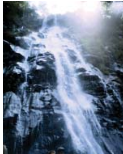
Jamuna Prapat (Bee Fall)

Pachmarhi was discovered by Captain Forsyth in 1857. The British developed Pachmarhi as a resort and their influence is embodied in its churches and colonial architecture. Jamuna Prapat (Bee Fall), Apsara Vihar (Fairy Pool), Rajat Prapat (Big Fall), Irene Pool, Handi Khoh, Jalawatara (Duchess Falls) and Sunder Kund (Sunder's Pool) are many of its cascading falls and pools. They all make for ideal family getaways. Dhoopgarh is the highest point in the Satpura range, with a magnificent view of the surrounding ranges.