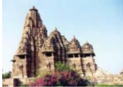
Kendriya Mahadev Temple

The best way is to take a Walkman Tour – pre-recorded audio cassettes