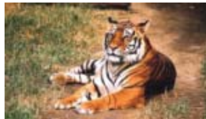
Tiger at Panna National Park

Dhubela: 64 km from Khajuraho, along the road to Jhansi, there is a small museum. Exhibits include Shakti cult sculptures, weapons, clothes and other personal belongings of the Bundela kings. Panna National Park: 32 km away, the road to Satna