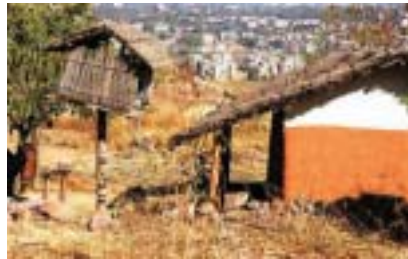
Tribal Habitat Museum

Art Gallery (2511334) with its collection of contemporary Indian art. The Tribal Habitat Museum (Museum of Man) is an open-air exhibition of tribal art and homes from all over India. Ancient rock-art