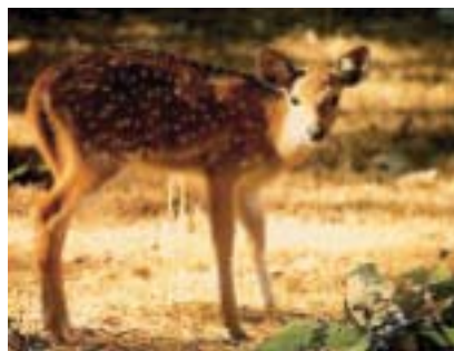
Chital at Satpura National Park

brothers. These caves are now protected monuments. Tridhara (Piccadily Circus) is a popular picnic spot where two streams meet in a junction. Vanshree Vihar (Pansy Pool) is another beautiful spot on the Denwa stream. A wonderful natural amphitheatre in the rock, approached through a cave-like entrance on the south-side is known as Reechhgarh. Sangam (Fuller's Khud - Waters Meet) is the lowest of the picnic spots on the Denwa and offers fairly good bathing pools. Catholic Church , built in 1892 by the British, its Belgium stained-glass windows add grace and beauty to the building. Christ Church was built in 1875. Its 'sanctum-sanctorum' has a hemispherical dome on top with its ribs ending with faces of angels. Satpura National Park , 524 sq km in area, spreads through dense forest of evergreen sal, teak and bamboo and is home to the bison, tiger, leopards, etc. Bison Lodge , of 1862, is