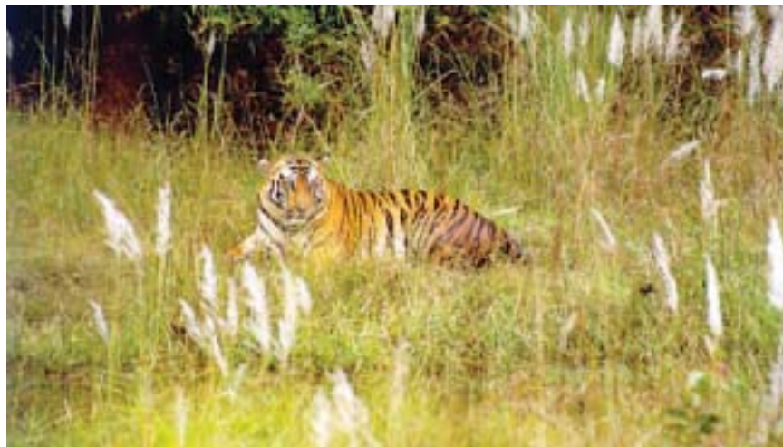
Tiger at Bandhavgarh National Park

WelcomHeritage Kanha Jungle Lodge: 216015, Royal Tiger Resort: 216028. Inside the park: MPSTDC's Baghira Log Huts: (07649) 277227, Tuli Tiger Resort: 277221, 2534784-88 and Tourist Hostel.