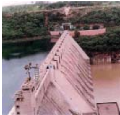
Gandhi Sagar Dam

cactus garden with over 1200 species of cactii. Maksi: 39 km from Ujjain, is