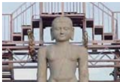
Bahubali statue at Gomatigiri

Deoguradia: 8 km away, on Nemawar road, here stands a half-rock monolithic temple dating back to 7th century, but which was redone in 18th century by Ahilya Bai. The original Shivalinga is 12 ft underwater, in a sunken temple above which the present temple is constructed. Every Shivratri (mid-Feb) a fair is held for