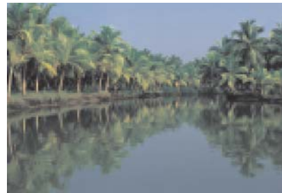
Backwaters at Kerala

Probably the most popular spot is Alappuzha Beach . An old lighthouse situated here adds a certain mystique to the area. Kottamkulangara Mahavishnu and Devi Temple are the oldest temples beside the lake. Mullackal Rajarajeshwari Temple is home to Goddess Rajarajeshwari who is known to come alive during the auspicious Navratras. Mannarasals Sree Nagaraja and Sri Krishna Temple (14 km from Alappuzha), depict the traditional temple architecture that Kerala is renowned for.