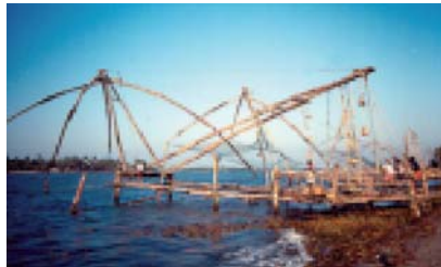
Chinese Fishing Nets

Fort Kochi is probably the best preserved history of colonial times. The architectural styles used in its various monuments and buildings reflect the bygone era. Walk through or cycle around for soaking in its