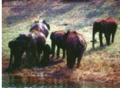
Elephants at Thekkady

Mullaperiyar Dam across the Periyar river adds to the charm of the park. A boat ride on the serene Periyar Lake is the best way to go about the Thekkady experience. Herds of elephants that come down to the lake to frolick are a major attraction. Apart from mongoose, bison, sambar and flying squirrel, you also have lush hills and spice plantations here!