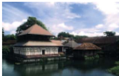
Ananthapura Lake Temple

Bekal: Renowned for the 3,000 year old Bekal Fort, good stretches of beaches, backwaters and colourful festivals. The nearest airports are Mangalore (80 km), Calicut (200 km), Cochin (390 km) and Bangalore (390 km). Kasargod (12 km) and Kanjangad (12 km) provide rail connections. Kodi Cliffs, Kappil Beach, Pallikere Beach, Bekal Aqua Park, Nithyanandasram, Ananthapura Lake Temple are some of the sights worth checking out.