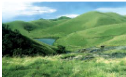
Eravikulam National Park

This hill station on the Western Ghats, immersed in tea estates is a getaway, charming beyond imagination. Though just relaxing in the greens seems like what the doctor ordered, you can visit a Tea Factory (permission for any of the 26 factories of Tata Tea Ltd can be obtained from their Regional Office in the centre of Munnar town. Another excursion could be to Devikulam , 15 km from Munnar. The Sita Devi Lake with its mineral waters and picturesque surroundings is a beautiful outing. The lake also offers good trout fishing opportunities. Top Station is known for the Neelkurinji plant that flowers only once in 12 years. It is at a distance of 37 km on the Munnar-Kodaikanal road at an altitude of 1,700 m. Top Station also has a panoramic view of the neighbouring state of Tamil Nadu. Echo Point (15 km from Munnar) is very scenic. Eravikulam National Park (15 km away) is situated in the Devikulam Taluk and is home to the Nilgiri Tahr. The Anamudi