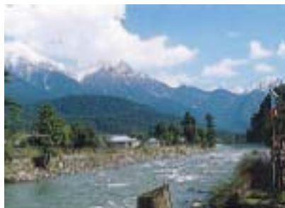
River Lidder, Pahalgam

Pahalgam: 95 km from Srinagar, the 'valley of shepherds' is at a height of 2130 metres. En route are interesting places like Pampore, Avantipur, Anantnag, Achabal, Kokarnag,