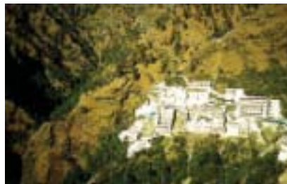
Vaishno Devi Shrine

Places in and around Vaishno Devi are all linked to the goddess and her legends. The Raghunath Mandir and the temples of Ardhkawari , Bhairon Ghati and Garbh Joon , en route the main temple, are all linked with incidents during the goddess' mythical fight with Bhairon Nath . Some of the most scenic spots around Katra