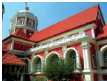
Shri Shantadurga Temple

and Muslim influences and has a seven-tiered lamp tower in the courtyard. The Shri Mahalsa Temple is an ancient one and Shri Shantadurga Temple is worth a visit.