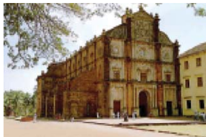
Basilica of Bom Jesu