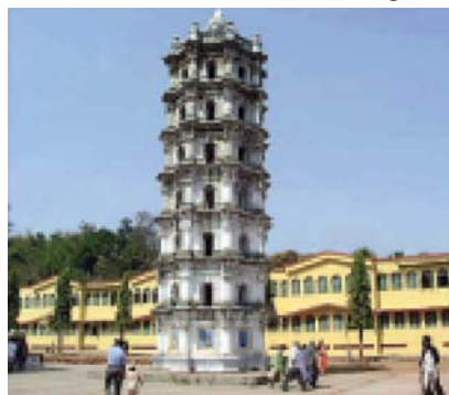
Shri Mangueshi Temple

South Goa boasts the Shri Mangueshi Temple , dedicated to Lord Shiva, which is a blend of Hindu, Portuguese