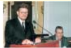
Conference & Event Management