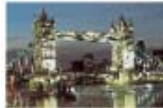
Outbound and Incentive Travel

With over 20 years' experience, International Travel House is a total travel management company with the ISO 9001 accreditation. With strategic affiliations, nationwide network, 24 x 7 travel counters and a complete range of in-house services, Travel House provides end-to-end travel solutions from ticketing, hotel accommodation, transportation and money changing to organizing of conferences and events.