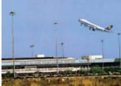
Indira Gandhi International Airport

Access: By Air: Delhi's international airport Indira Gandhi International is the most important gateway to North India. Most international airlines offer flights to and from Delhi, connecting to almost every part of the world. On the domestic circuit, the Domestic Airport provides flights to every corner of the country, and is as important as Mumbai for air travel. Besides Indian Airlines, Jet Airways and Air Sahara, even Air-India operates night flights to many metro cities. By Rail: Being a strategically located capital, Delhi is connected to nearly all state capitals and tourist and business centres in the country, through a large rail network. Rajdhani and Shatabdi Express trains run from Delhi to all the other major metros daily. Metro Rail , the fastest means of transport in a city, started in 2003 in Delhi, is fast emerging as an efficient alternative to crowded buses. Railway Stations: There are four major stations in Delhi: the Old Delhi Railway Station (situated in the Walled City), New Delhi Railway Station (close to Connaught Place), Nizamuddin Railway Station (close to The Oberoi flyover) and Sarai Rohilla Railway Station . Apart from these, there is the