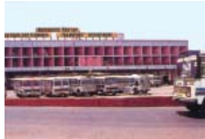
ISBT at Kashmere Gate

Delhi Cantonment Railway Station in West Delhi, the boarding point for tourist trains like 'Palace on Wheels' and 'Fairy Queen'. By Road: The Inter State Bus Terminus (ISBT) has buses arriving and departing for all the states in the northern region. Bus Terminus: