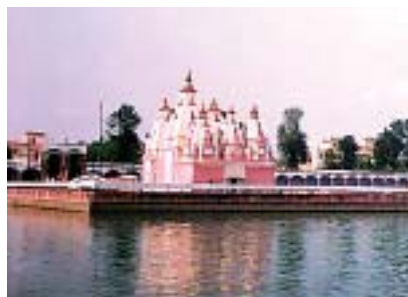
Brahma Sarover – Kurukshetra

Kurukshetra , about three and a half hours drive from Delhi, is where the