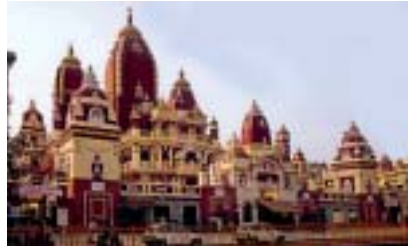
Laxmi Narayan Mandir

emporia is Hanuman Mandir . Due west from Connaught Place is the Laxmi Narayan Mandir , built by industrialist G D Birla in 1938.