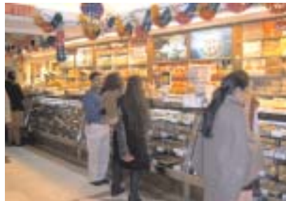
Bengali Sweets (Bengali Market)

shops are: Nathu's and Bengali Sweets in Bengali Market, the chaat shops in Sunder Nagar, and Kwality Chaat Bhandar in Greater Kailash.