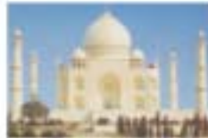
Inbound and Domestic Travel