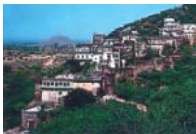
Neemrana Fort Palace

Surajkund , about 35 km away from the city centre, is famous for its crafts' mela held between 1st February and