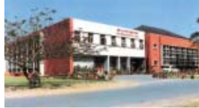
Indian Veterinary Research Institute

Fifty-two km from Nainital and 26 km from Ramgarh, Mukteshwar has memorable views of the magnificent Himalayas. Indian Veterinary Research Institute , known for its contribution to animal-related research, is located here. Trek down the ridge to nearby Sitla (5 km), to reach the ideal wilderness for pitching your tents and go camping. On the way back, climb up the stone steps to the