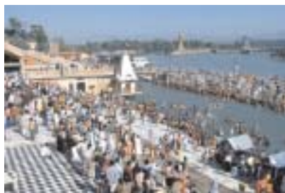
Har Ki Pauri

Har Ki Pauri (Brahm Kund) is the main ghat . Locals believe that this is the spot where Ganga leaves the