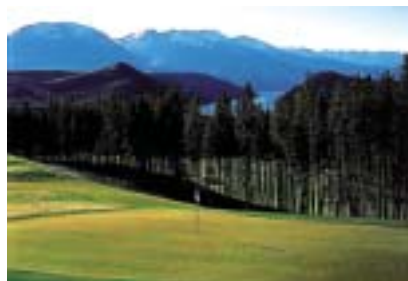
Upat Kalika – Golf Course

Chaubattia , 20 km away, is a garden spot commanding a fascinating view of the Himalayas. An attraction is the Government Apple Garden and Fruit Research Centre here. Baludham , little less than 3 km from Chaubattia, is known for a small artificial lake. Four km away is Upat Kalika , one of the best mountain golf courses (9 holes) in