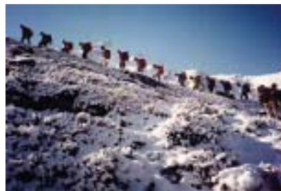
Mountaineering at Gangotri

Hospitals: District Hospital: Uttarkashi, Primary Health Centre: Harsil.