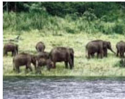
Elephants at Jim Corbett

Leopards are often seen here in the hilly terrains and outskirts of the park; the more powerful tiger dominates the prime areas. The jungle cat and the rare fishing cat frequent grassland and