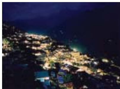
Joshimath at Night

Perched high above the confluence of rivers Saraswati and Dhauliganga, Joshimath, or the winter home of Lord Badri, was established by Guru Shankaracharya in the 8th century. Besides basic minimum tourism infrastructure of a tourist bungalow, a few small hotels and dharamshalas , there are a few temples too, prominent being the Narsingh Temple , dedicated to Vishnu in his lion form. Worth visiting to pay obeisance is the Vasudev Temple Complex . This pilgrim centre also forms the base for trekking to the pristine Valley of Flowers.