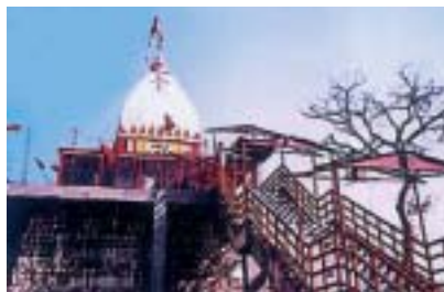
Main Entrance of the Chandi Temple

mountains to enter the plains. Lord Vishnu's footprint on one of the stones here is revered by thousands. The Ganga arti in the evening is a highlight. Take a cable-car ride up to the Mansa Devi Temple , located on a hill above the city, to have one's wishes fulfilled. Open between 8 am to 5 pm (closed for lunch between 12 pm to 2 pm). The more enterprising can attempt to climb up the 1.5 km stretch. On another hilltop is Chandi Devi Temple , that can be approached by the cable car or on foot. It is believed that seven holy sages had prayed at Sapt Rishi Ashram for the welfare of humanity. The Ganga flows in seven