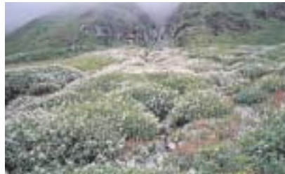
Valley of Flowers