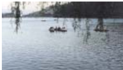
Naini Lake – Nainital

The huge, blue-green Naini Lake is one of the prime attractions of this hill town. Deriving its name from its eye-like shape, here in this Naini Lake you can boat or fish, or better still, stroll around the Lake. Combine this with souvenir shopping at the Mall .